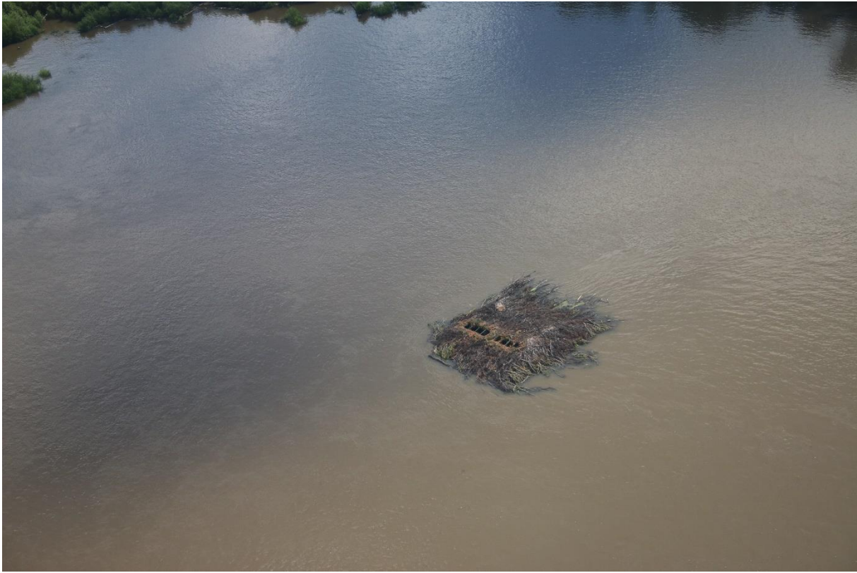
Photo 3. Mississippi River flood waters ravaging a duck blind just south of Oquawka, Illinois on September 12, 2018. Hopefully, these hunters will have time to rebuild the blind before duck season begins in late October!