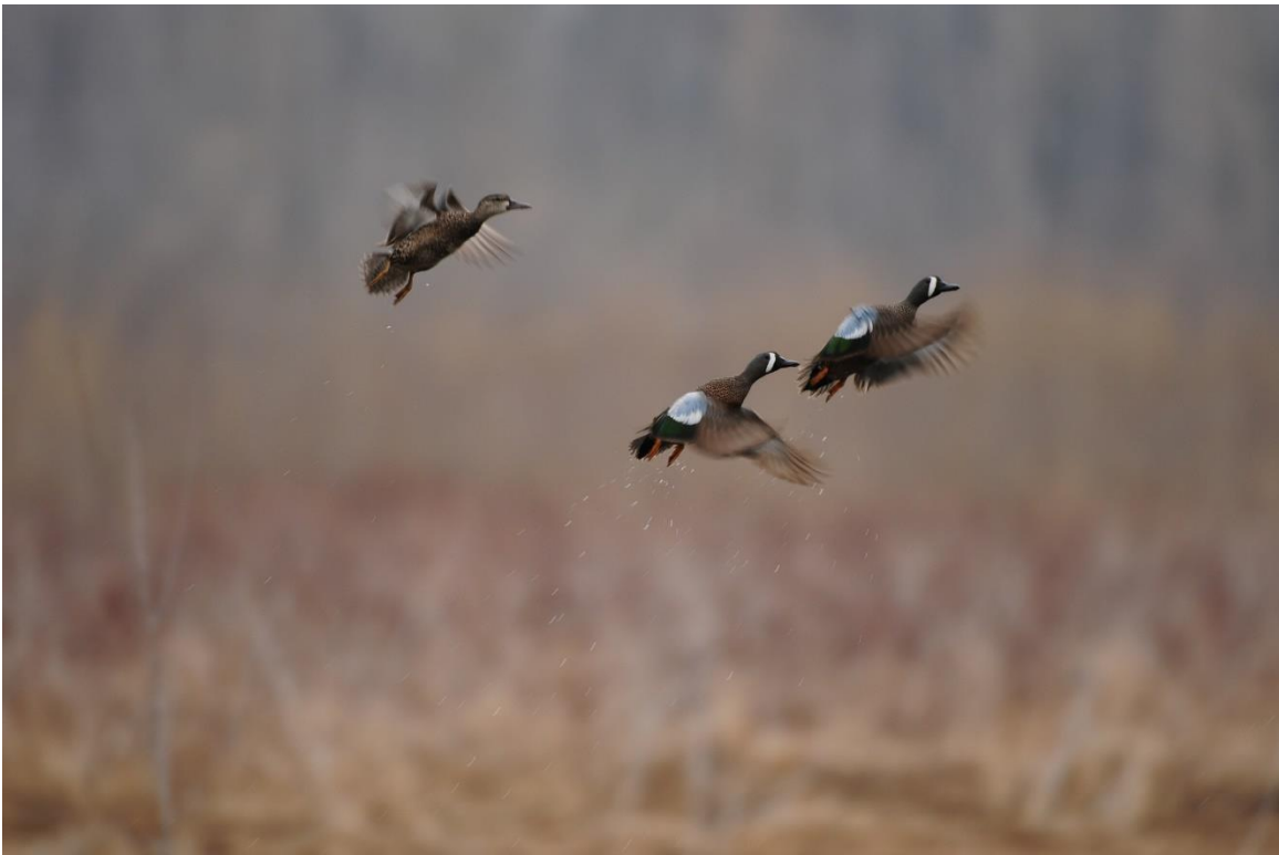
Photos 1-2. Blue-winged teal in breeding plumage taken last spring by Ryan Askren. Note the beautiful plumage of the males while adorning their nuptial plumage. During summer/autumn migration, the plumage of males resembles that of the cryptically colored females.